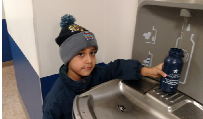
A dental patient fills his new water bottle at CUPHD