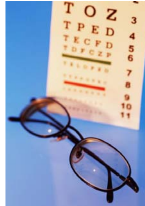
Total Clients Serviced 165

Child Vision and Hearing Screening The CUPHD Hearing and Vision Screening Program provides state-mandated hearing and vision screening to licensed day care, preschools, public schools and parochial schools. CUPHD employs a state certified auditory and vision technician