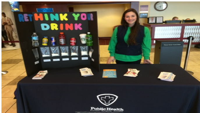
Rethink Your Drink