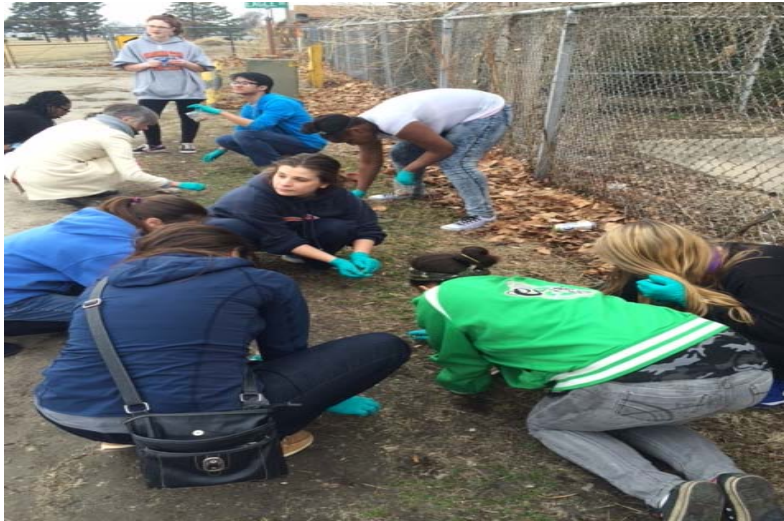
REALITY picked up cigarette butts at Wabash Park in Rantoul.