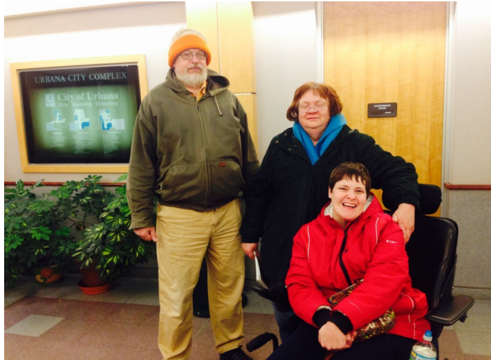
A few of the Edge of the Mall tenants after speaking at the Urbana City Council Meeting.