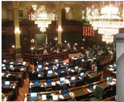
ADVOCACY DAY 4-11-13

On April 11, 2013, we took 28 Students from J.W. Eater, and area schools to the capitol in Springfield. The students learned about the legislative process and were trained on how to advocate to their legislators. We were in Springfield for most of the day learning and meeting with our local legislators.