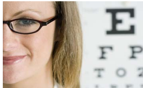
Total Clients Serviced for June 190