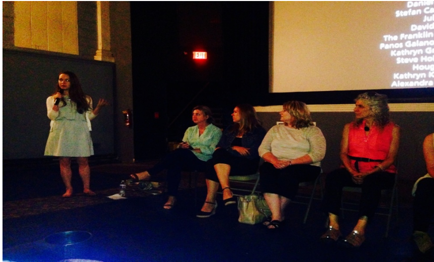
Let's talk about Sex, at the Art Theater.