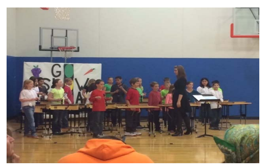
Go, Slow, Whoa Concert at Lincoln Trail Elementary.