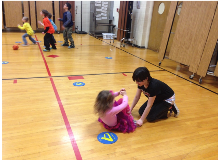
CATCH Family Match Night at Wiley